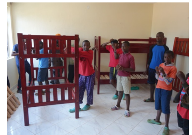
Some of the boys moving into the new building at the Haven

It was on a fall day the summer after our mission trip that God answered my seeking and spoke to me that he wanted me to start a YouTube Channel and to share my passions of both Him and the outdoors! (continued page 3)