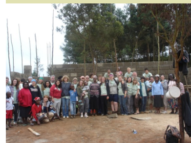
Our 2010 Mission Team To Kenya!