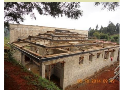
The New Kitchen Building At Haven On The Hill We Plan On Helping Finish Come July!