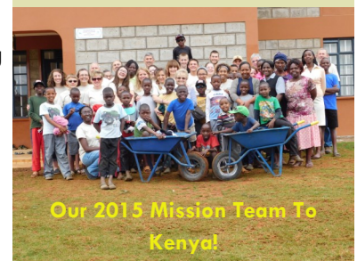
Our 2015 Mission Team To Kenya!