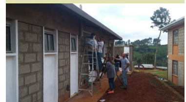
Some Of Our 2015 Team Helping To Bring The New Kitchen At The Haven Closer To Completion